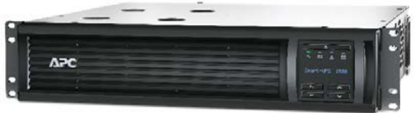
[ SMT1500RM2U ]