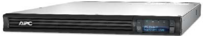
[ SMT1500RM1U ]