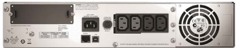
[ SMT1500RM2U ]